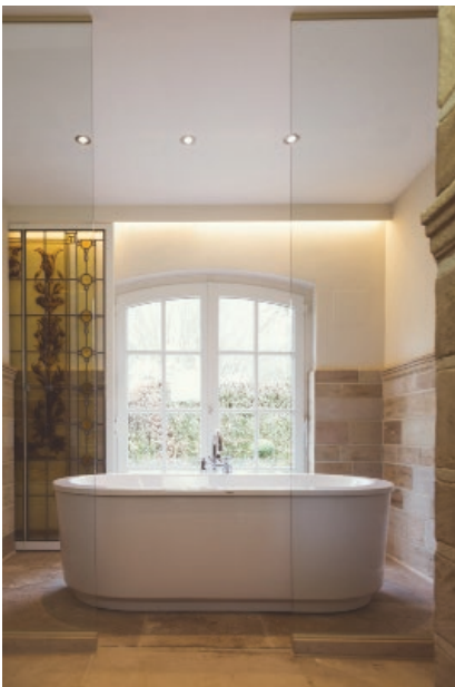
How to Draw a bath training