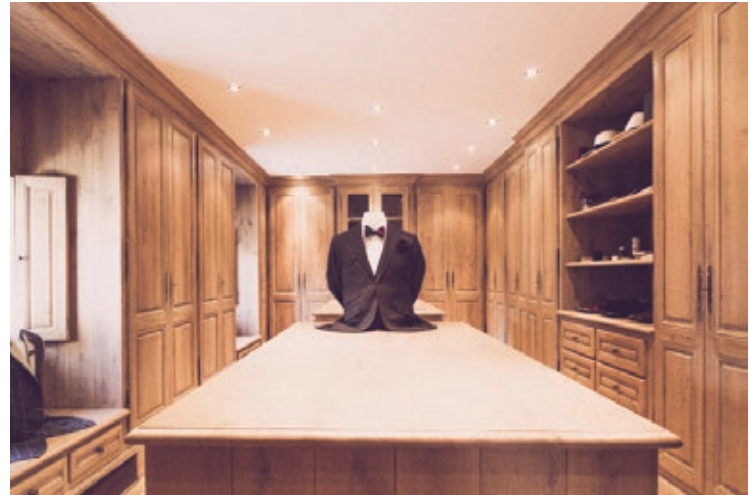
Walk in Dressing