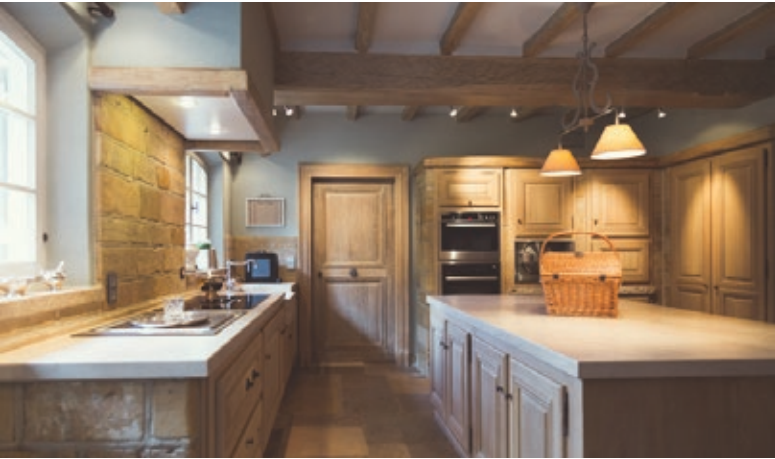
State of the art Kitchen