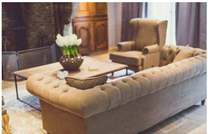
Domestic management system