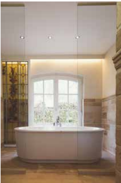
How to Draw a bath training