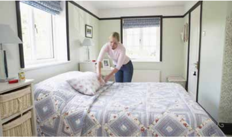
How to service a room