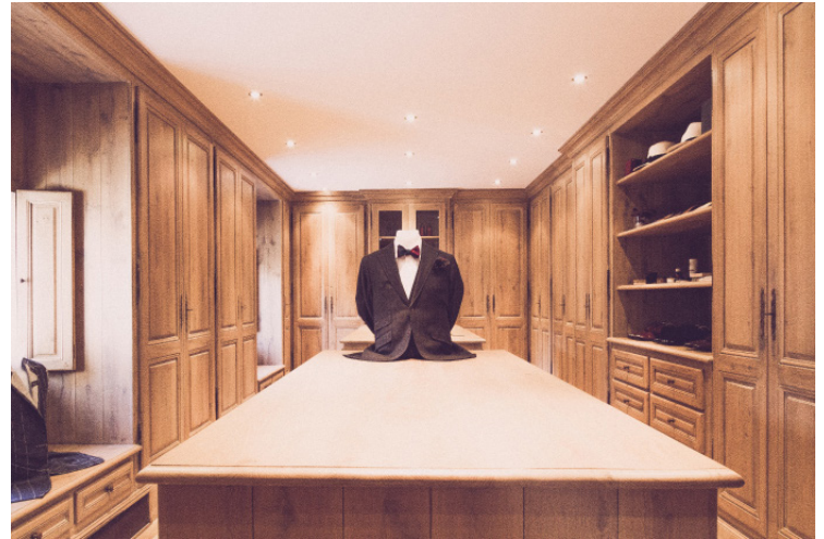
Walk in Dressing